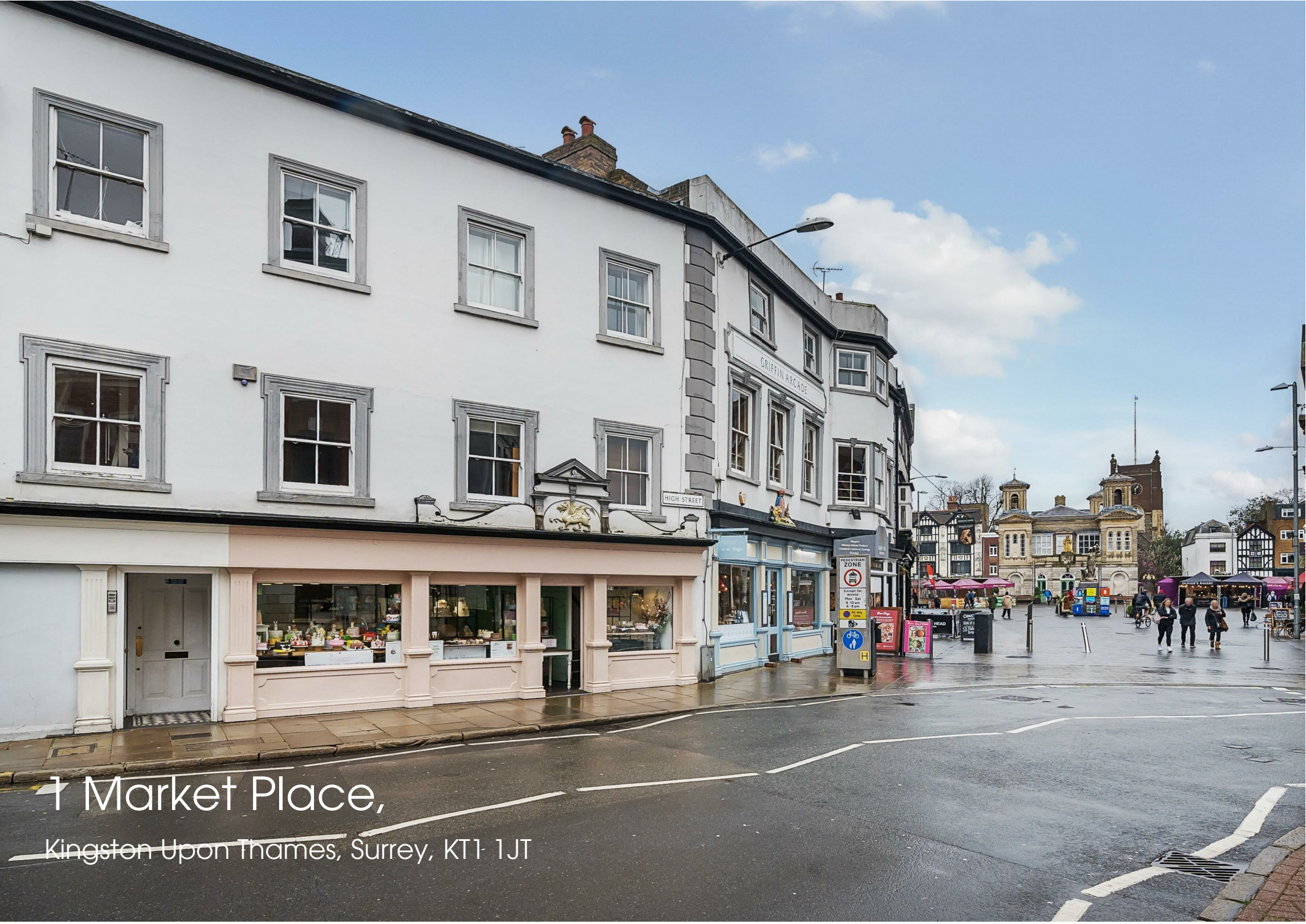
↑ Market Place, Kingston upon Thames, Surrey, KT1 1JT